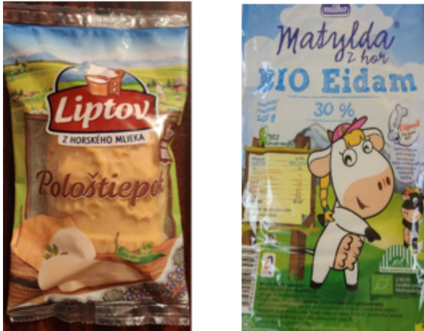
Figure 1: Photographs of traditional Slovak cheese packaging